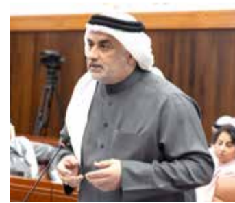
MP Mamdouh Al Saleh

rain's flag carrier is pulling its weight in making travel smoother, from entry procedures to onward flights.