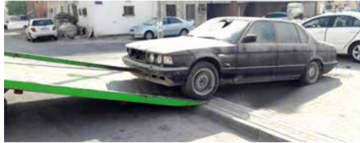
Abandoned car removed from the street

road safety and maintain the aesthetic appeal of public spaces, may result in fines of up to BD300 for vehicle owners.