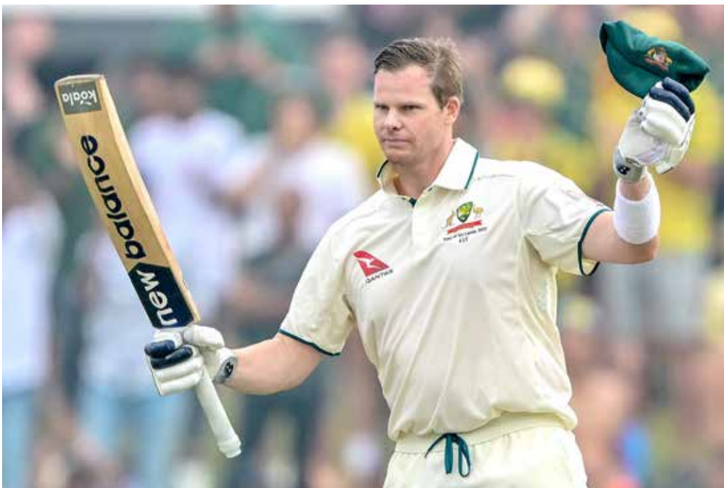
Australia's captain Steve Smith