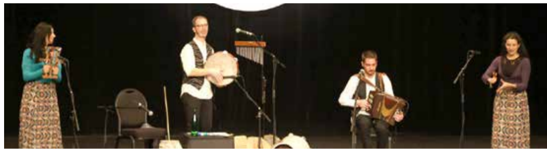
Guests and attendees enjoy the captivating Italian performance on stage

The event showcased the rich dance and musical traditions of the Italian regions of Apulia,