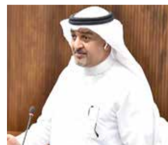
MP Jalal Kadhem

It argues that including them in the social insurance system will prevent years from being wasted without coverage, par-