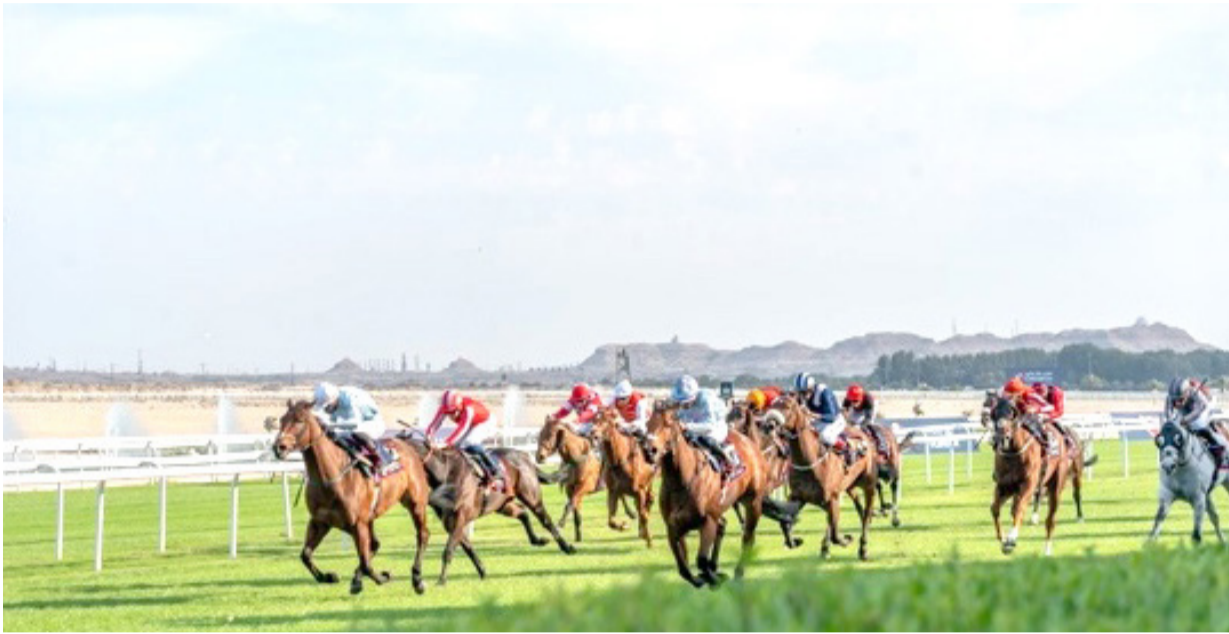
TDT | Manama

Crown Prince's Cup Festival set for a thrilling showdown