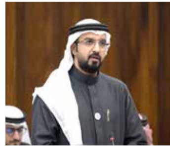
MP Hassan Ebrahim

the government's current and planned moves to bring in tourism dollars, build up the sector's backbone, and open doors for outside investment.