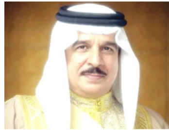
HM the King

As per the law approved by the legislative councils, deductions