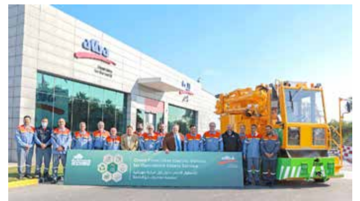
Opening of the pilot programme for an electric, battery-powered Aluminium Fluoride (ALF3) feeding vehicle