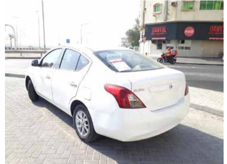
A car for sale parked in a public area

The vehicles in question were left behind by their owners and were removed following a legal notification period as stipulated by the Public Cleanliness Law, issued under Decree No. 10 of 2019. Offenders may face fines of up to BD300 for non-compliance.